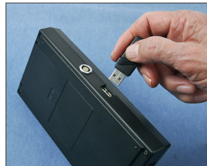
Transfer data directly to USB Flash drive

The MS4500E can store 16,000 readings per probe on up to 250 different probes (4 million total). Stored data can be downloaded directly to a USB Flash ("jump") drive in non-hazardous areas. Data can be opened and charted using the provided Corrosion Data Management software, or can be imported into any standard data analysis (spreadsheet) program such as Microsoft Excel. Data can also be reviewed and charted on the instrument's LCD display for quick reference.