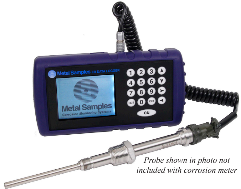
Probe shown in photo not included with corrosion meter

After taking a reading, the instrument displays metal loss in mils and corrosion rate in mils per year (mpy). The reading can then be stored to memory or discarded. All stored readings are automatically time and date stamped. Readings are stored to non-volatile Flash memory which retains data without the need for a battery backup.